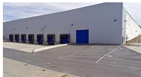
▶ ZELE ▶ To Let: Warehouse 12.317 sq m + Offices