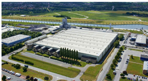
► STRÉPY ► To let Warehouse 12.900 and 19.000 sq m + Offices