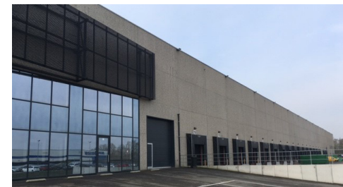
► MILMORT ► To let: Warehouse 7.578 sq m + offices