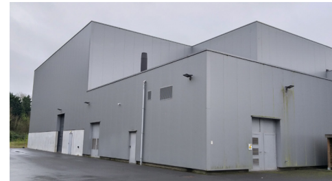
▶ LEMBEEK ▶ To Let: Warehouse 3.970 sq m + Offices