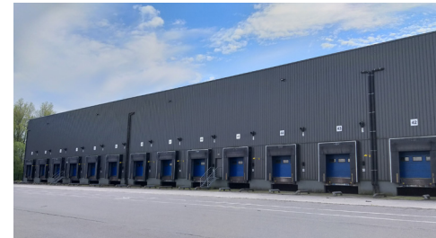
► NIVELLES ► To Let: Warehouse units, total +/- 90.000 sq m + Offices