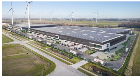
► PÉRUWELZ ► To Let: Warehouse units of +/- 10.000 sq m