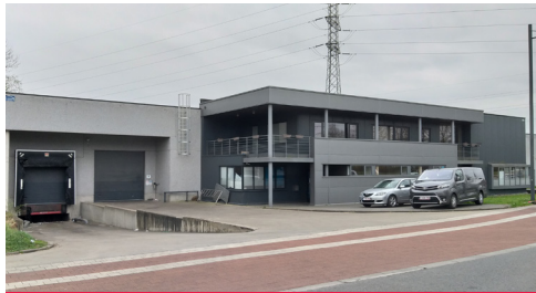
▶ ANDERLECHT ▶ For Sale: Warehouse 3.700 sq m + Offices