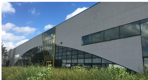
► GOSELIES ► To let: Warehouse +/- 10.000 sq m + offices