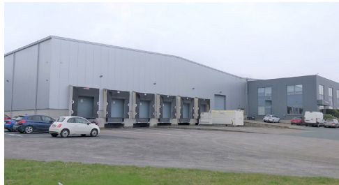
► SAINTES ► To Let / For Sale: Warehouse 7.316 sq m + Offices 1.361 sq m