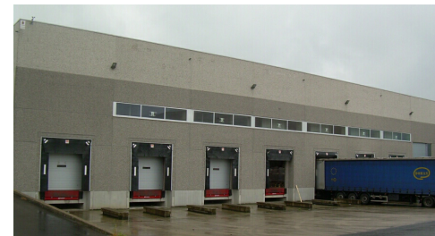
► TOURNAI ► To Let : 18.131 sq m divisible