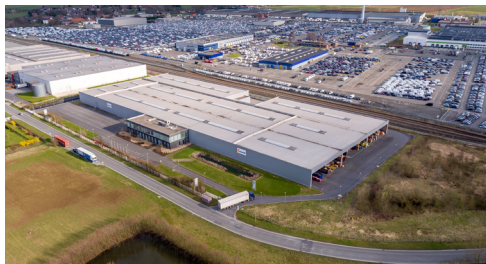
► GHISLENGHIEN ► To Let Warehouse units of 5.400, 4.320 & 3.060 sq m