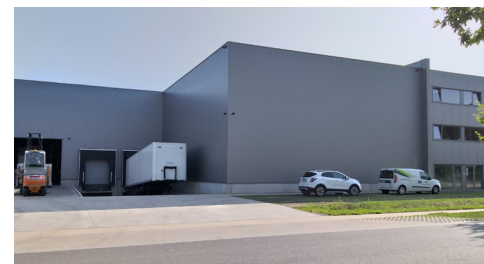
▶ BILZEN ▶ To Let: Warehouse 2.500 sq m + Offices