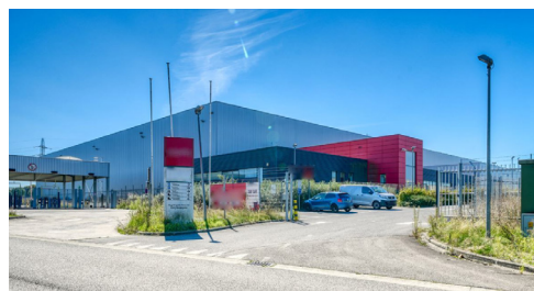
► HEPPIGNIES ► To let: Warehouse 11.518 sq m + offices + exterior storage