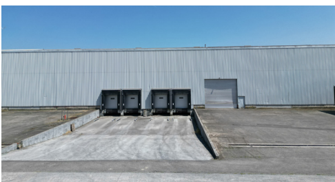
► GHLIN ► To let: Warehouse units of 2.725, 4.620 & 4.720 sq m + Office