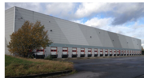
► TRAZEGNIES ► To let: Warehouse 12.414 sq m + Offices