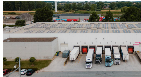
▶ BEERSEL ▶ To Let: Warehouse 6.654 sq m + Offices