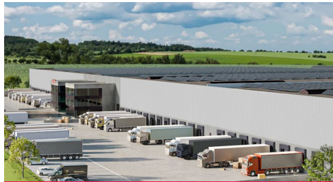
► TONGEREN ► To Let: Warehouse 16.000 sq m + Mezzanine + Offices