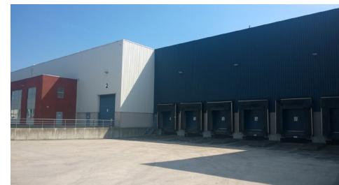
▶ MEER ▶ To Let: Warehouse 6.586 sq m + Offices