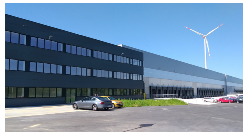
▶ BILZEN ▶ To Let: Warehouse 19.985 sq m + Offices