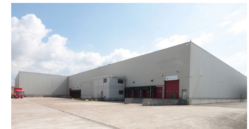
▶ DUFFEL ▶ To Let: Warehouse 4.078 sq m