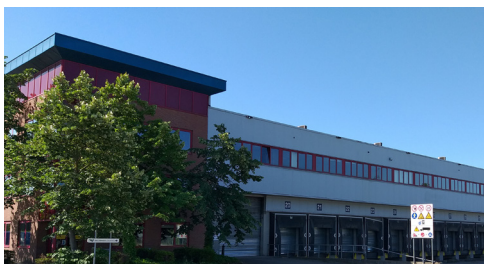
▶ GENK ▶ To Let: Warehouse units of +/- 2.600 sq m + Offices