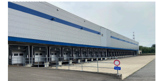
▶ GENK ▶ To Let: Warehouse 13.352 sq m + Offices