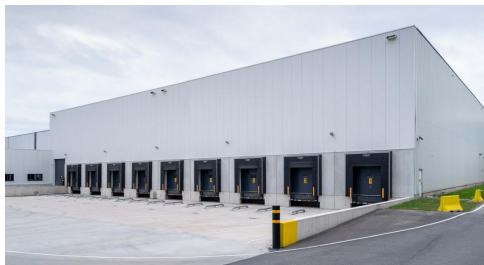
▶ WILLEBROEK ▶ To Let: Warehouse 7.529 sq m + Offices