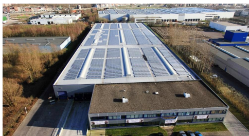
▶ BOOM ▶ To Let: Warehouse 8.695 sq m + Offices