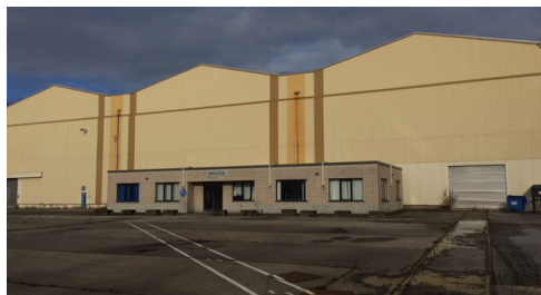
► BOUFFIOLX ► To let: Warehouse 19.000 sq m + Offices