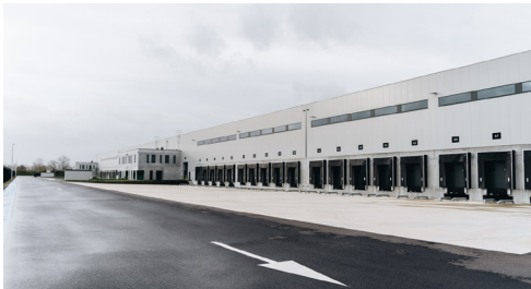
► ZEEBRUGGE ► To Let: Warehouse units of +/- 7.300 sq m + Offices