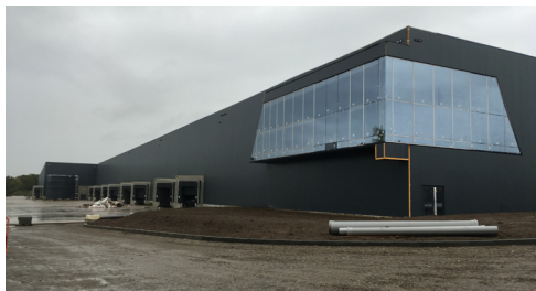
► LONTZEN ► To let: Warehouse units of 7.017, 7.665 & 12.728 sq m + offices