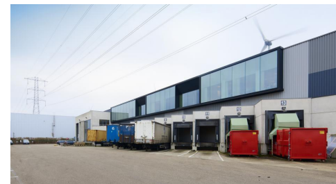
▶ GEEL ▶ To Let: Warehouse 8.223 sq m + Offices