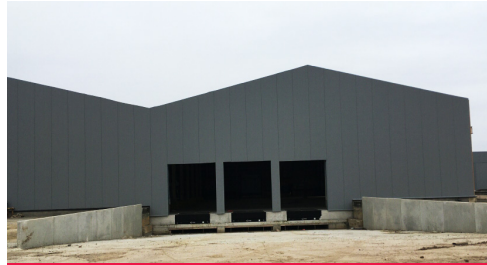
► MANAGE ► 1.000 to 10.000 sq m