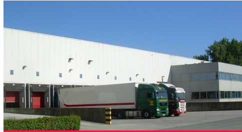
► BEERSEL ► 6.654 sq m + Offices 505 sq m