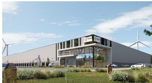
► GENT NORTH SEA PORT ► 10.000 + 20.000 sq m ( Project )