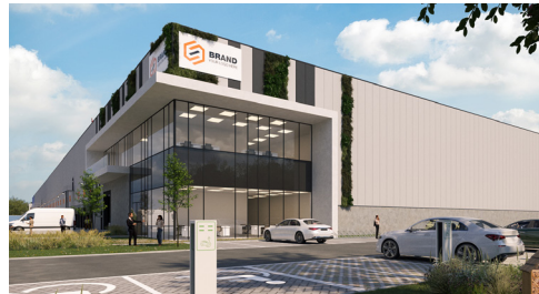
► LOKEREN ► 10.000 to 15.000 sq m ( Project )