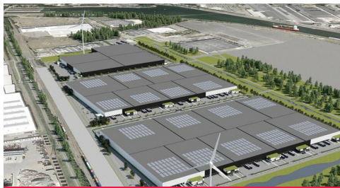
► GENK ► 75.579 sq m Divisible ( Project )