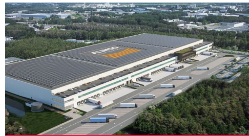
► TESSENDERLO ► 52.000 sq m Divisible + Offices ( Project )