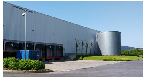
► GHISLENGHIEN ► 5.700 sq m