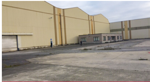
► BOUFFIOLUX ► 3.000 sq m to 19.000 sq m ( Cranes )