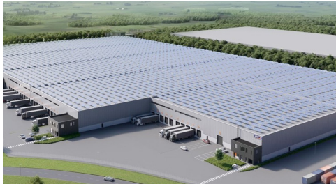
► ZEEBRUGGE ► 7.442 to 44.000 sq m