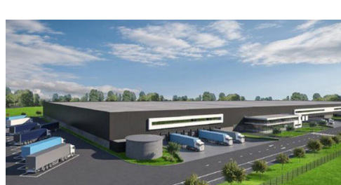
► DOUR ► 11.584 sq m to 104.076 sq m ( Project )