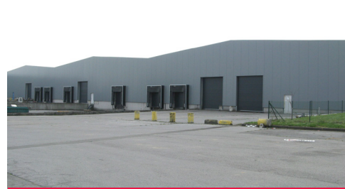
► HERSTAL ► 5.000 sq m