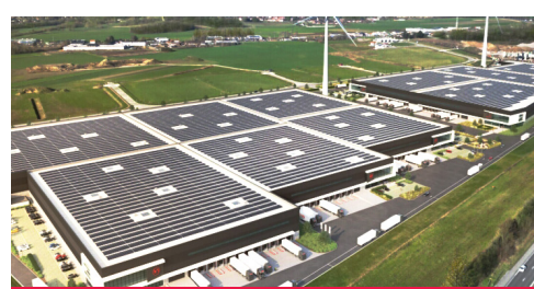
► PÉRUWELZ ► 8.937 sq m to 109.753 sq m + Offices ( Project )