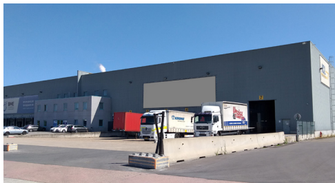
► GENK ► 5.500 sq m + Offices 250 sq m