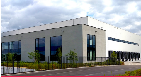
► VILVOORDE ► 12.030 sq m + Offices 1.130 sq m + Mezzanine 1.571 sq m