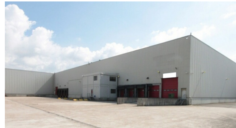
► DUFFEL ► 4.078 sq m