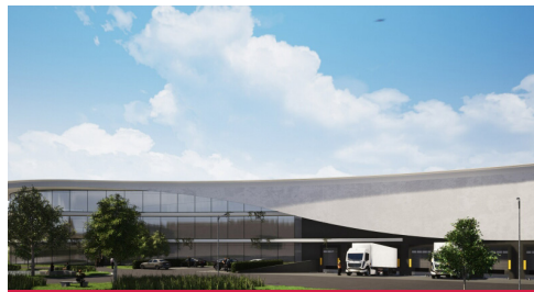
► LUMMEN ► 27.072 sq m + Offices ( Project )