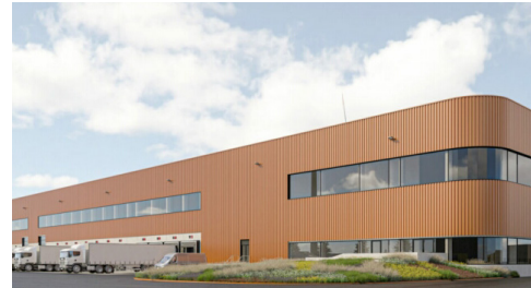
► HAM ► 48.000 sq m + Offices ( Project )