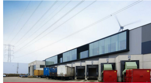
► GEEL ► 18.966 sq m + Mezzanine 3.784 sq m + Offices 2.014 sq m