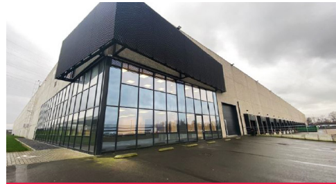
► MILMORT ► 7.587 sq m + Offices 540 sq m