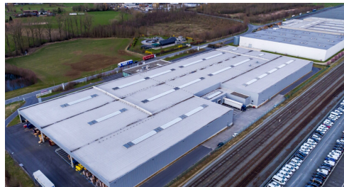
► GHISLENGHIEN ► 11.700 sq m + Offices Divisible