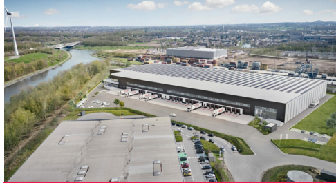
► LA LOUVIÈRE ► 11.548 sq m to 23.601 sq m + Offices ( Project )