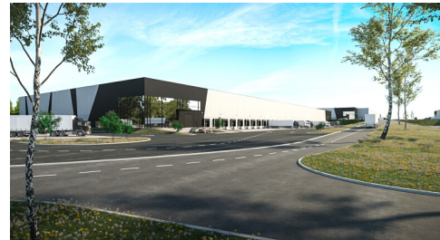
► LA LOUVIÈRE ► 12.608 sq m to 68.566 sq m (Project)