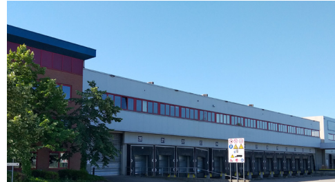
► GENK ► 7.850 sq m + Offices 848 sq m Divisible