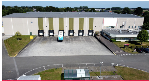
► LONDERZEEL ► 7.483 sq m + Offices. Short term lease possible.