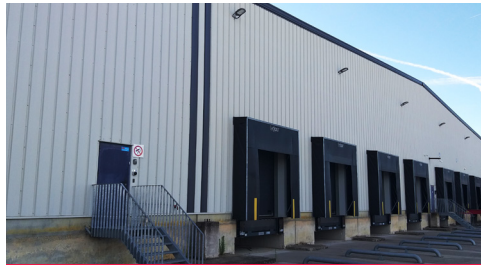
► PUURS ► 6.875 sq m