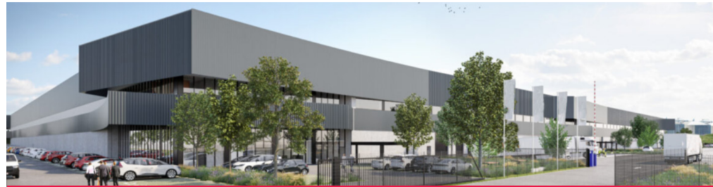
► DUNKERQUE ► 9.329 sq m to 60.266 sq m