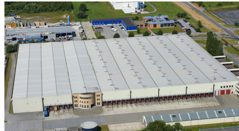
► STRÉPY ► 12.000 to 31.000 sq m + Offices