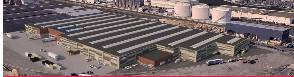
► PORT OF ANTWERP ► Warehouse 29.477 sq m + Offices. Divisible