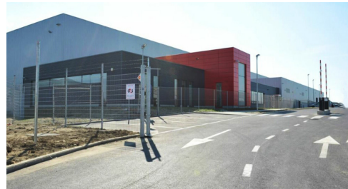
► HEPPIGNIES ► 13.381 sq m + Offices 730 sq m + P